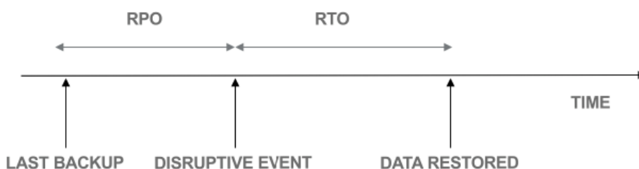
Figure 3 - Visual representation of RPO and RTO

RTO is the maximum loss of availability following a disruptive event measured by the maximum amount of time before the application fully recovers.