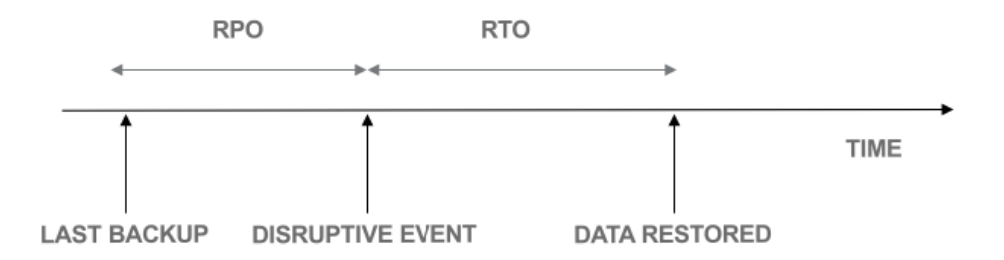
Figure 3 - Visual representation of RPO and RTO

RTO is the maximum loss of availability following a disruptive event measured by the maximum amount of time before the application fully recovers.